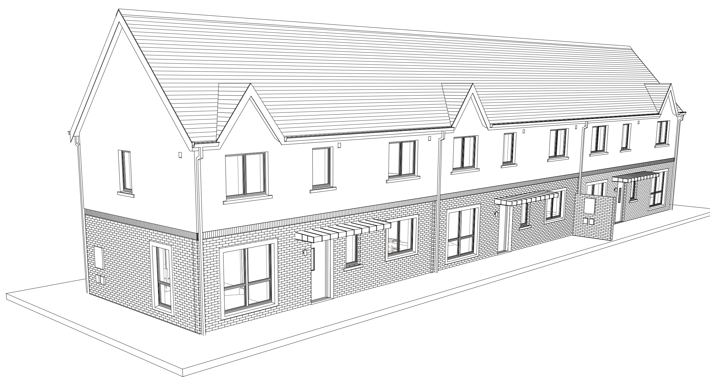
3D - HOUSE TYPE C2 & C1 & D (NTS - for information)